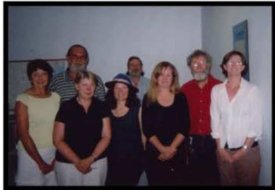
Management Committee 2005

Family Advocacy was founded by families of people with disability in 1991, however, our beginnings go back even further, to the creation of the Family Education Unit (FEU) in 1984. We differ from carer organisations in that our family members are advocating for people with disability to have a good, ordinary life through natural community based supports and socially valued community roles. We do not advocate for parents or siblings themselves, and believe first and foremost in the importance of authentic inclusion for all people with disability.