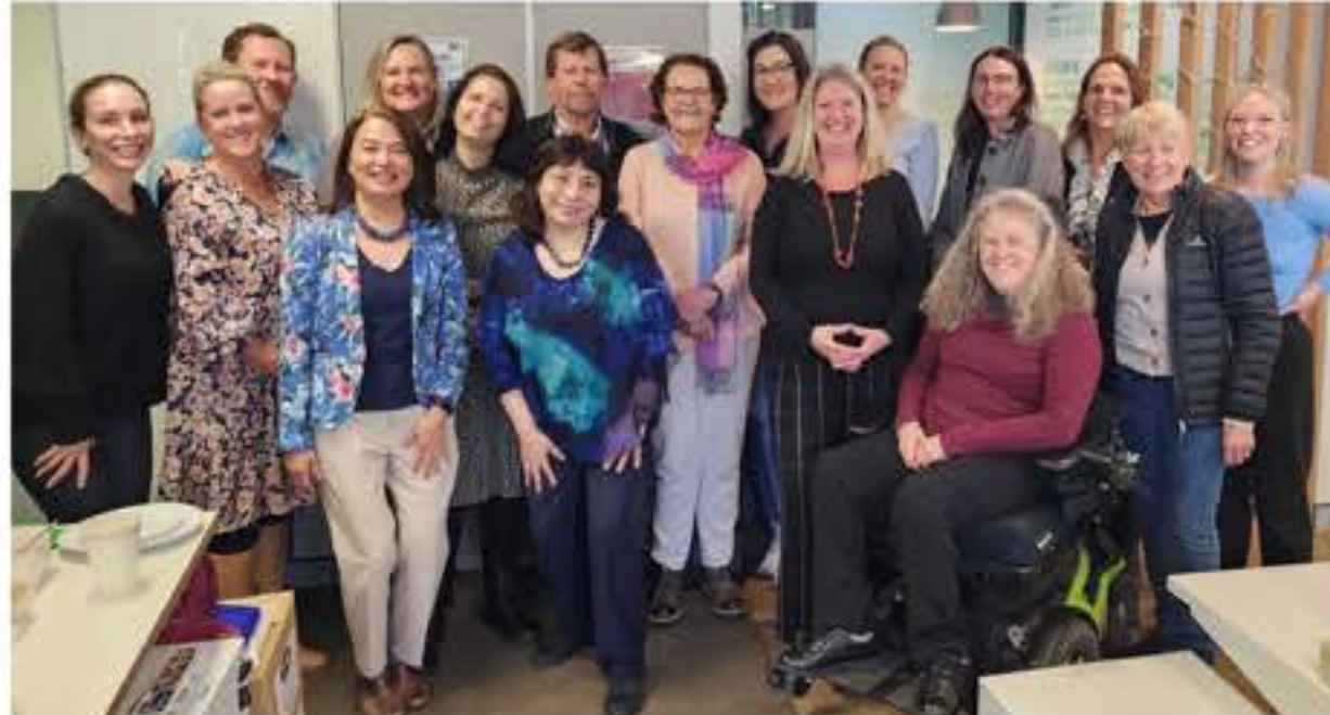
Management Committee and staff 2023